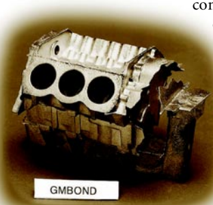
GMBond-produced engine block, 1996