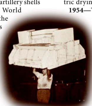
Lost Foam Pattern, 1950s

1957—The vertically-parted flaskless green sand molding machine is invented by