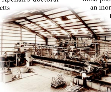
Matchplate Molding Machine, 1960s